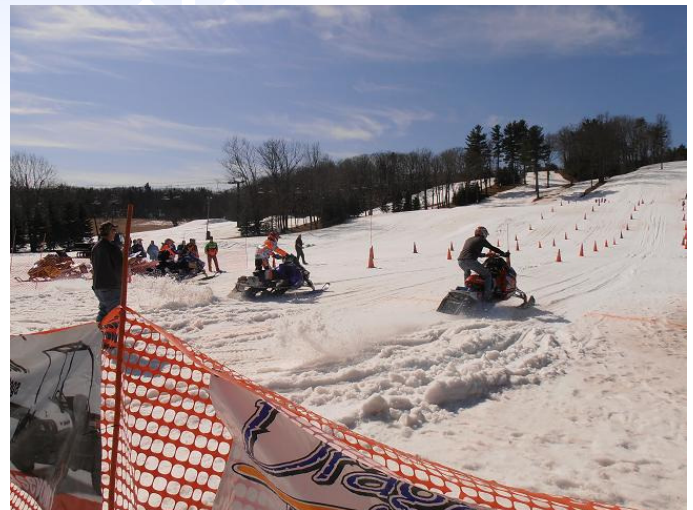
Snowmobiles launch from the starting line during the hill climb drags on March 11.