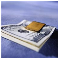
Funds for grooming

Now imagine this whole process duplicated 5 times, that is what the Frontier Sno Riders deal with each season. There are 5 local sponsors, including the counties of Montgomery,