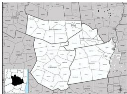
Frontier grant funding sponsor areas.

One thing is for sure, it will change and we need to be ready for whatever happens.