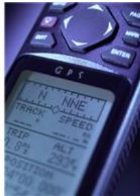
GPS records the trails

In another example, a club had a very active winter, with a lot of grooming. The club spent the entire 70% award and had to use reserve funds to keep up with the grooming. Now at the end of the season the club finds it had spent enough to receive the entire 30% award in the fall. They will likely have spent more but will not receive more than the award.